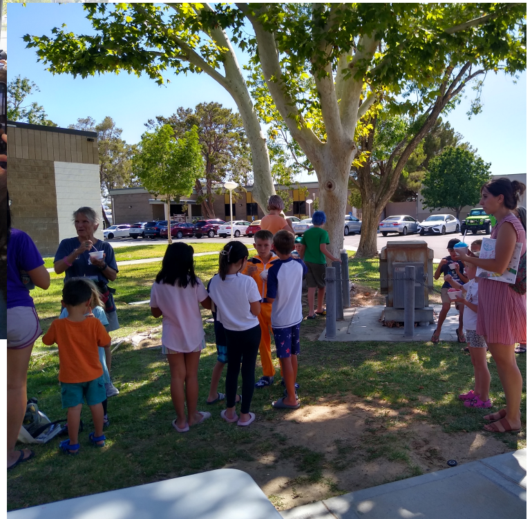
Tutu's Shave Ice